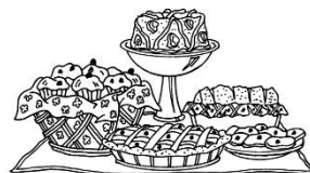
Bakeless Bake Sale

* Dismissal L: Go in Peace, and Serve the Lord. C: Thanks be to God.